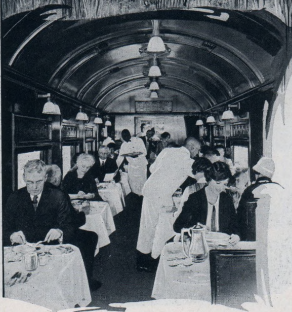
Dining par excellence

worth more than passing note. You are on a fine train—in equipment, service, personnel, comfort.