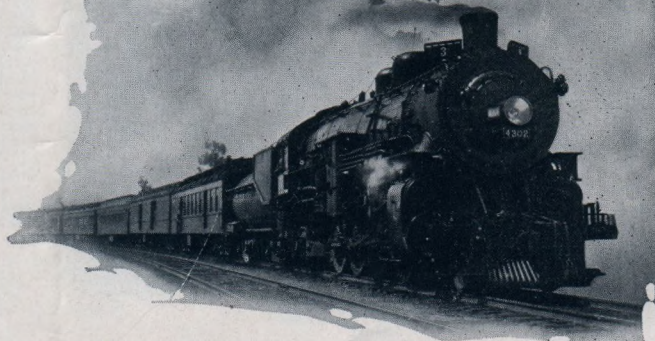
Giant power—smooth and resistless

Phoenix, bustling city; surrounded by a spacious valley reclaimed from the desert for the service of man. Hundreds of thousands of acres growing crops under irrigation where once grew nothing but sagebrush and cactus. A great sweep of rich new territory just opened for development as a result of the recent completion of a new Southern Pacific main line through Southern Arizona via Phoenix.