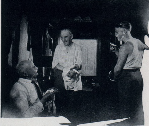
Cheerful even before breakfast

Then add to the physical excellence of this great train the most vital element of all, personnel. The men who operate this train are proud of it and justly so, for there is none finer anywhere.