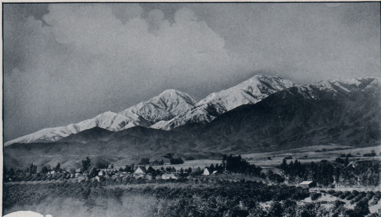
Green-and-gold orange groves and snow-capped mountains

ings. Great dams, including world-famous Roosevelt Dam. Three lakes—Roosevelt, Apache and Canyon—strung end to end for 70 miles of the way. And all seen in comfort while rolling along paved highways.