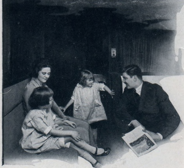
Drawing rooms and compartments offer homelike privacy

and Douglas; nearby the Chiricahua National Monument or Wonderland of Rocks, the Mission San Xavier, near Tucson—these are but a few of the high points of your trip through Arizona.