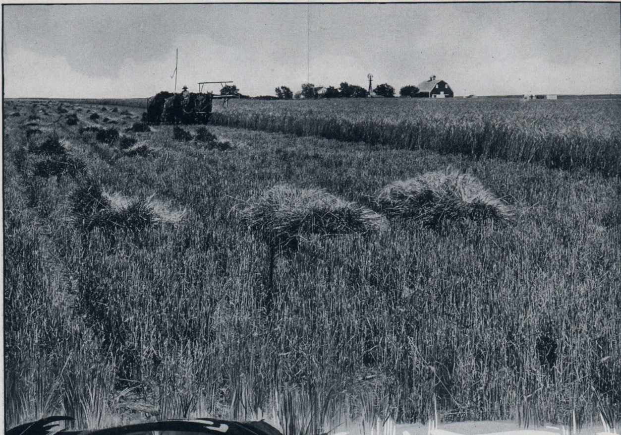
Kansas fields of golden grain