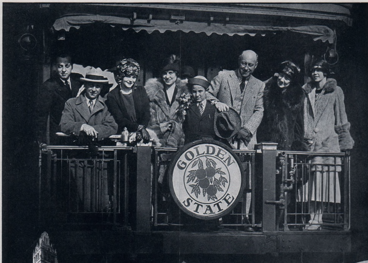
The departure a ceremony