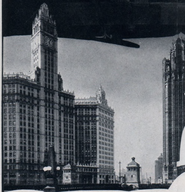
Tower landmarks of Chicago—a few blocks from Rock Island Lines' La Salle Street Station, eastern terminal of Golden State Route