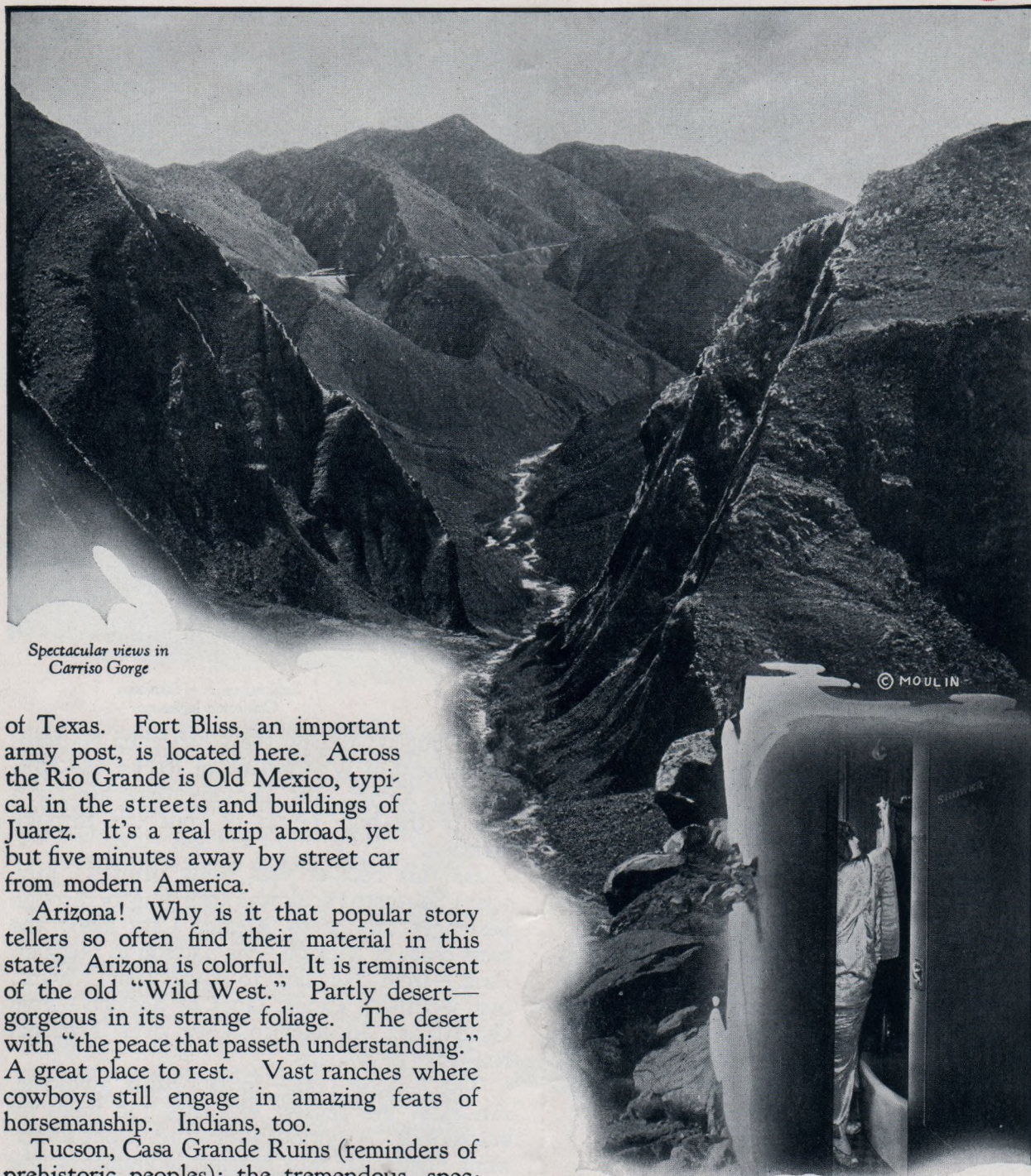
Spectacular views in Carriso Gorge

of Texas. Fort Bliss, an important army post, is located here. Across the Rio Grande is Old Mexico, typical in the streets and buildings of Juarez. It's a real trip abroad, yet but five minutes away by street car from modern America.