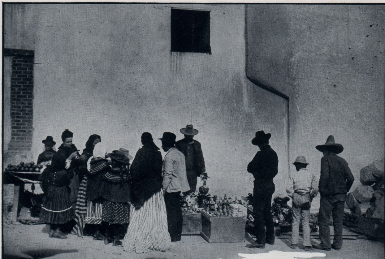
Juarez is Old Mexico—just over the Rio Grande