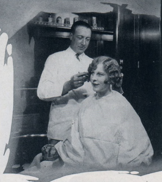
Fresh and trim en route—barber and valet service

All the appointments of the "Golden State Limited" will delight you.