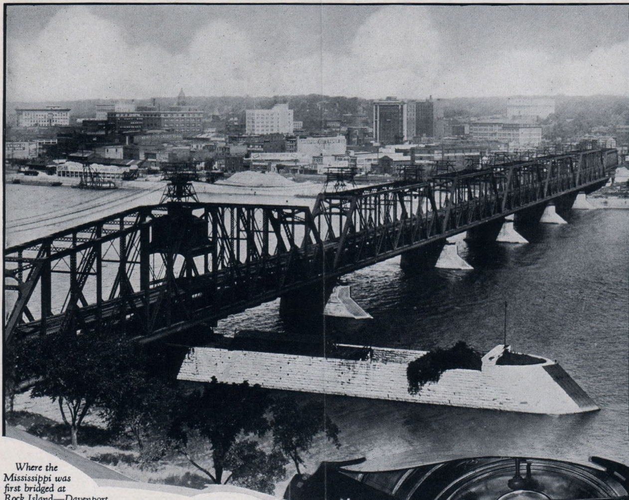
Where the Mississippi was first bridged at Rock Island—Davenport

T HE courtesy, the thoughtfulness and the friendly interest in your welfare that are distinctive of Golden State service are noted when you begin to plan your trip.