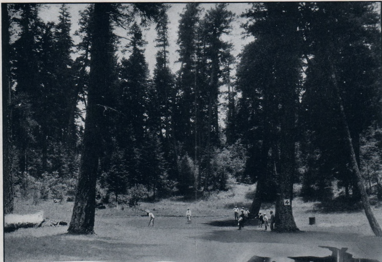
Cloudcroft for play

Hark! Hear the mission chimes—announcing that a delicious meal awaits you in the dining car. At your convenience you enter the dining car. Leisurely you enjoy your meal as the train reels off the colorful panorama of your trip.