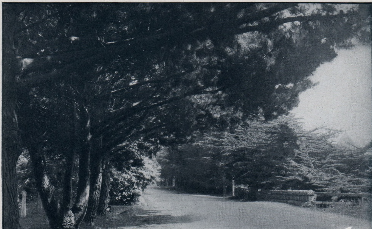
Enticing miles of Southern California highways