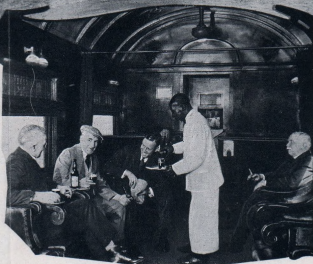
The friendly club car

First of all, become acquainted with your train. It is the "Golden State Limited" and